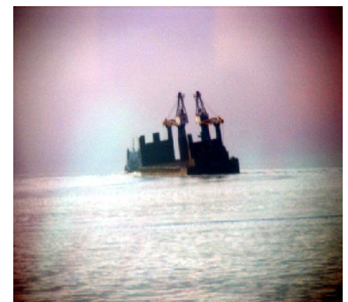
Log Barge on the way from Gibson's Landing to Vancouver

Our Collective Agreement also has Article 19.03—Banked Time (pg. 36) which outlines the guidelines.